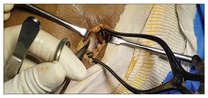
Figure 4: Deep dissection.

guidance, reduced, and multiple inside-out sutures are passed and retrieved through the posterolateral safety incision. The sutures are passed with the knee in the figure-of-four position, and the arthroscope is placed in the posterolateral safety incision to visualize and retrieve the sutures. The technique is described in Video 1.