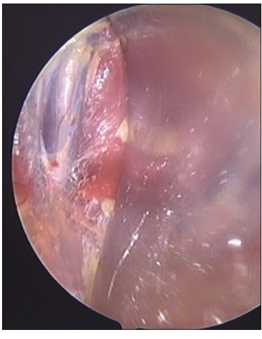
Figure 5: Identification of popliteal vein.

guidance, reduced, and multiple inside-out sutures are passed and retrieved through the posterolateral safety incision. The sutures are passed with the knee in the figure-of-four position, and the arthroscope is placed in the posterolateral safety incision to visualize and retrieve the sutures. The technique is described in Video 1.