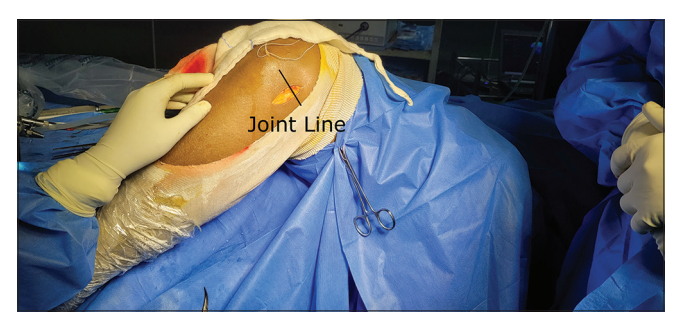
Figure 1: Skin incision.