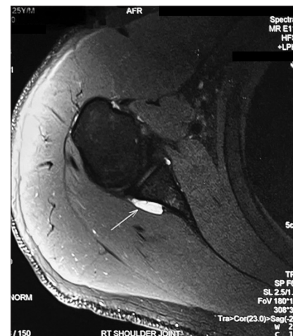
Figure 2: T2 weighted MRI axial section with the white arrow showing paralabral cysts near the postero-superior labrum.