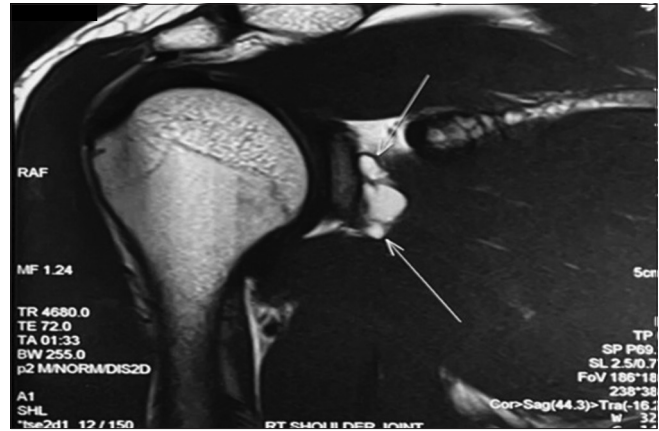
Figure 1: T1 weighted MRI saggital section with the white arrows showing paralabral cysts.

Patients with other upper limb injuries and no H/O sporting activities were excluded from this study. Patients aged <20 years and more than 30 years were not included in this study. Patients with signs of severe muscle atrophy and neurological weakness were not included in the study.