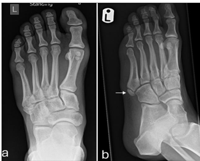
Figure 1: A 26-year-old footballer presented with foot pain after an injury. (a) Anteroposterior and (b) oblique radiographs showing os vesalianum pedis (white arrow).

Treatment options depend on the fracture location, the presence of radiographic union, and the patient's medical fitness and activity level.