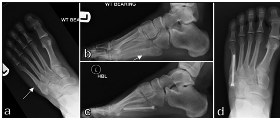
Figure 3: (a) Anteroposterior and (b) lateral radiographs of a 19-year-old professional footballer showing Jones-type fracture (white arrows). (c) Anteroposterior and (d) lateral radiographs 10 weeks later showing union following intramedullary screw fixation.

IM: Intramedullary, ESWT: Extracorporeal shock wave therapy