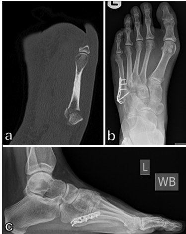
Figure 4: 30-year-old female runner 8 weeks after injury. (a) Computed tomography scan showing comminuted tuberosity fracture. (b) Anteroposterior and (c) lateral radiographs following fixation with a hook plate.