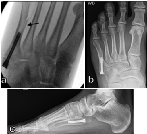
Figure 5: (a) Intraoperative radiograph showing iatrogenic fracture (black arrow) in the fifth metatarsal shaft following fixation with intramedullary screw. (b) Anteroposterior and (c) lateral radiographs showing both fractures united 3 months after surgery.

patients can weight bear in a walker boot for 6–12 weeks. If there is no evidence of clinical and radiographic union by 12 weeks, surgical fixation is recommended. In high-demand or athletic patients, surgical fixation with IM screw may be considered the first line of treatment, following a discussion of treatment options with the patient [Figure 3]. For Zone 3 fractures, we opt for percutaneous fixation without fracture site debridement. Hook plates are reserved for comminuted tuberosity fractures [Figure 4].