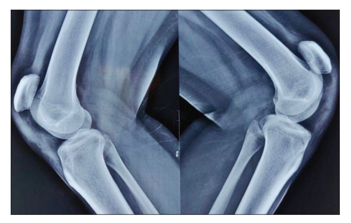
Figure 1: High riding patella.

Guarded rehabilitation was started with post-operative long knee immobilizer for 4 weeks. Static quadriceps was started