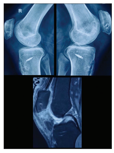
Figure 5: Six months follow-up radiology showing restored patellar height.

It has been shown in anthropometric studies that female population in Indian subcontinent have small and thin semitendinosus and gracilis grafts<sup>[7,8]</sup> which sometimes are inadequate for repair. We believe internal bracing the semitendinosus and gracilis augmented repair construct with fiber tape can help protecting the repair in early