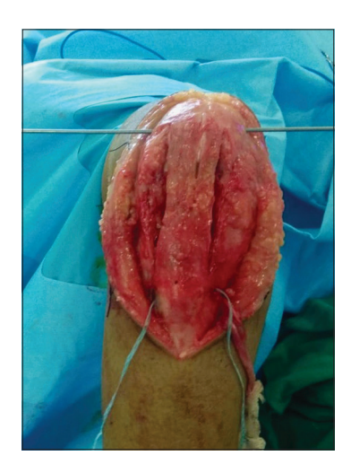
Figure 2: Hamstring harvested and tibial and patellar tunnels created.

on the 1st post-operative day. Partial weight-bearing with immobilizer and walker was started on the 2<sup>nd</sup> post-operative