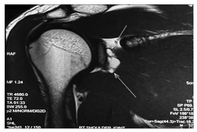
Figure 1: T1 weighted MRI saggital section with the white arrows showing paralabral cysts. MRI: Magnetic resonance imaging.

Patients with other upper limb injuries and no H/O sporting activities were excluded from this study. Patients aged <20 years and more than 30 years were not included in this study. Patients with signs of severe muscle atrophy and neurological weakness were not included in the study.