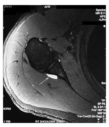
Figure 2: T2 weighted MRI axial section with the white arrow showing paralabral cysts near the postero-superior labrum. MRI: Magnetic resonance imaging.