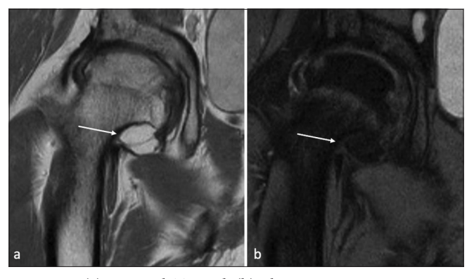
Figure 2: (a) Coronal T2 and (b) short-tau inversion recovery images show a centimetric intra-articular mass along the inferior margin of the femoral neck (white arrows).

arborescence, synovial osteochondromatosis, PVNS, hemangioma, liposarcoma, and intra-articular lipoma.<sup>[1]</sup>