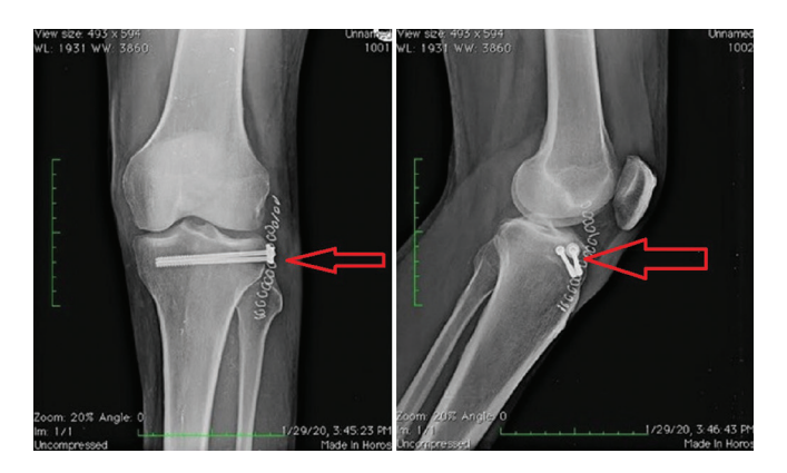
Figure 4: Post-operative X-ray: AP and lateral showing fixation marked by arrow.