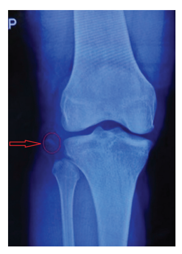
Figure 6: Arcuate complex avulsion marked by arrow.