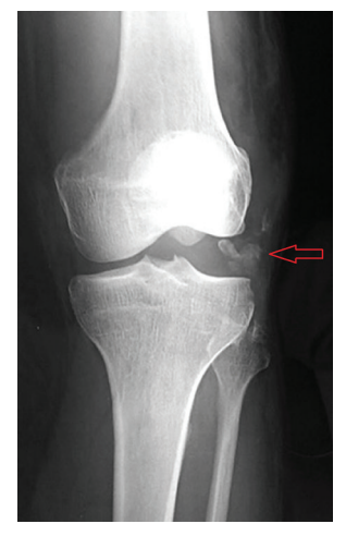
Figure 7: Biceps femoris avulsion marked by arrow

would have predisposed the patient for further knee injury and early medial compartment degeneration.