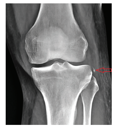
Figure 5: Segond fracture - tibial avulsion of LCL marked by arrow.

Despite a relative paucity of symptoms, this patient required adequate fixation and stabilization of the ITB as his knee joint would only worsen with time. Any delay in the procedure would have led to an increase in knee joint instability and