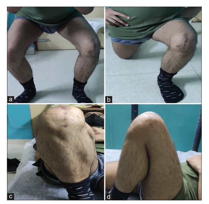
Figure 3: (a-d) Clinically squatting, forward lunging, and knee range of motion.