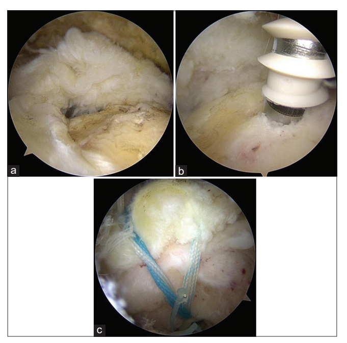
Figure 1: (a) Arthroscopic view of rotator cuff tear, (b) triple loaded polyether ether ketone suture anchor used for fixation, and (c) double row arthroscopic rotator cuff repair.

Statistical analysis was carried out with the help of SPSS (version 20) for the Windows package (SPSS Science, Chicago, IL, USA). The description of the data was done in form of arithmetic mean ± SD for quantitative data while in the form of frequencies (%) for qualitative (categorical) data. P < 0.05 was considered significant. For quantitative data, Mann-Whitney U-test was used to test the statistical significance of the difference between means of variables among two independent groups. Wilcoxon test was used to test the statistical significance of difference means between paired groups.